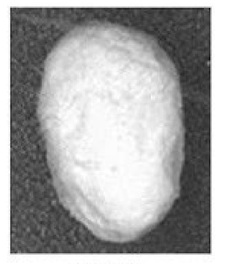
総破精 So-haze (All-rounded haze)